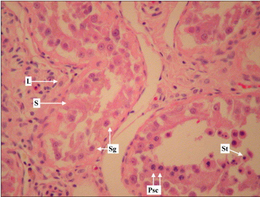
Fig. 3. Histological section (H&E; x400) of the testis of Cheetah AJ138. L = Leydig cell; Psc = primary spermatocytes; S = Sertoli cell; Sg = spermatogonia; St = spermatid.